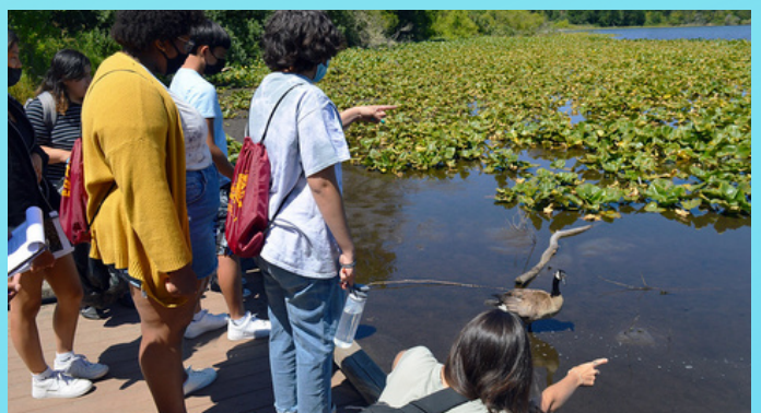
Top Right: Students engage in beading activity. Bottom right: LINK students exploring habitat around Waughop Lake.