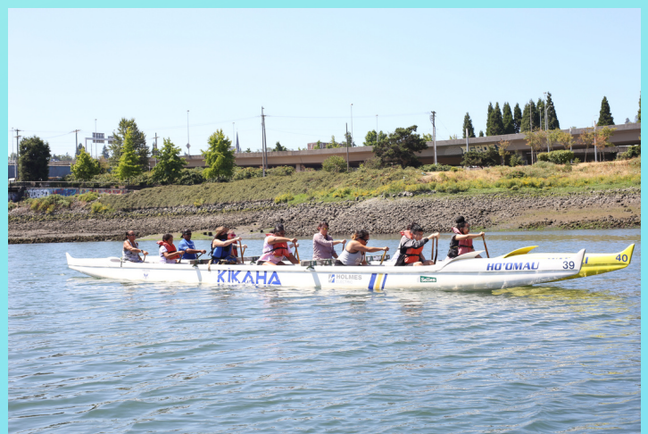
Left: UB students at the Billie Frank Jr Reserve; Top right: Students participating in a Dream Workshop with the UW; Bottom right: UB students and staff on the water in a double-hull canoe with Hawaiian Outrigger Club Ki Kaha o ke Kai.